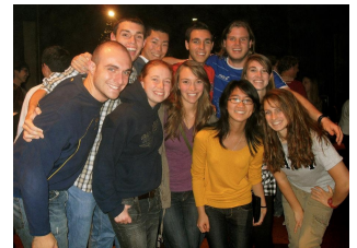
SouthSiders at David Crowder Band's 7 Tour

To be people who are living transparent lives and well-aware of the unique